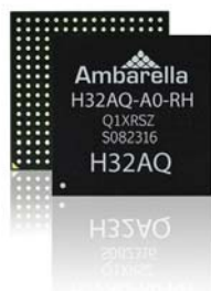
The H32AQ chip targets automotive camera designs

H32AQ provides ample host CPU performance to implement application code and other lightweight computer vision algorithms such as localization and map building (SLAM) or neural networks.