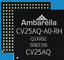
The CV25AQ chip targets automotive sensing camera designs.

The CV25AQ's CVflow architecture provides computer vision processing at 6MP resolution, enabling image recognition over long distances with high accuracy. It includes efficient encoding in both AVC and HEVC video formats, delivering high-resolution video encoding with very low bit rates. The CV25AQ's next-generation image signal processor (ISP) provides outstanding imaging in low-light conditions while high dynamic range (HDR) processing extracts maximum image detail in high-contrast scenes, further enhancing the computer vision capabilities of the chip. It includes a suite of advanced cyber-security features such as secure boot with TrustZone ® and secure memory, true random number generator (TRNG), one-time programmable memory (OTP), DRAM scrambling and virtualization, and a programmable secure level for each peripheral interface. A complete set of tools is provided to help customers easily port their own neural networks onto the CV25AQ SoC.