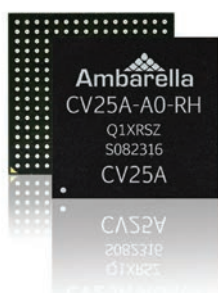
The CV25A chip targets dashcam designs

CV25A implements a highly efficient 8MP30 AVC (H.264) / HEVC (H.265) encoder in hardware along with an industry-leading image signal processor (ISP). The CV25A's ISP provides outstanding imaging in low-light conditions while high dynamic range (HDR) processing extracts maximum image detail in high contrast scenes, further enhancing the computer vision capabilities of the chip. The flexible architecture allows encoding of multiple streams that are optimized for storage and video streaming over WiFi / BLE at the same time. The chip also supports ultra wide angle and fisheye lenses by performing distortion correction of the video in hardware. The CV25A's CVflow architecture provides computer vision processing at full 8MP resolution to enable image recognition over long distances and with high accuracy. The CVflow core allows implementation of algorithms such as forward collision warning, lane departure warning, driver monitoring, and so on. A complete set of tools is provided to help customers easily port their own neural networks onto the CV25A SoC.